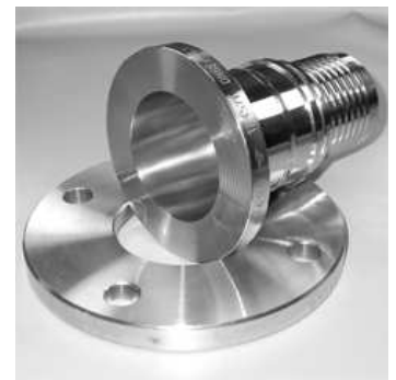
Losflansch swivel flange

Ra < 0,8/1,6 \mu\text{m} internal/external = hygienic class H3