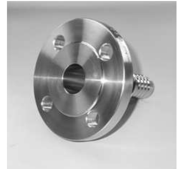
Festflansch fixed flange