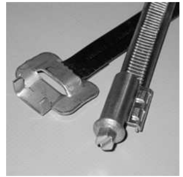
Spannband, Verschluss D + G band, bucking clip+fastener

SPANNBAND glatt / geprägt BAND solid / worm drive