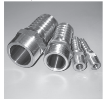
Schlauchtülle DIN 2999