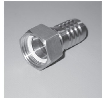
Schlauchtülle mit Überwurfmutter DIN ISO 228