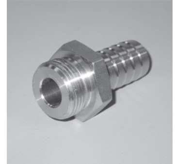
Schlauchtülle mit zylindrischem Außengewinde DIN ISO 228