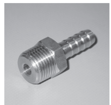
Schlauchtülle DIN 2999